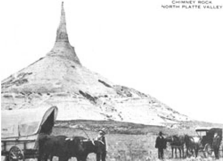
Ezra Meeker in front of Chimney Rock, c. 1906