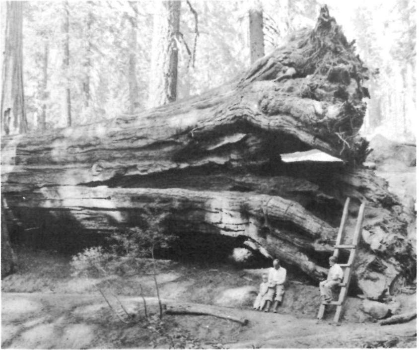
The Fallen Michigan Tree.

during the winter season, but informal accommodations are available. All forms of winter sports, except skating, are enjoyed, and snowshoes, skis, and toboggans may be rented at reasonable prices.