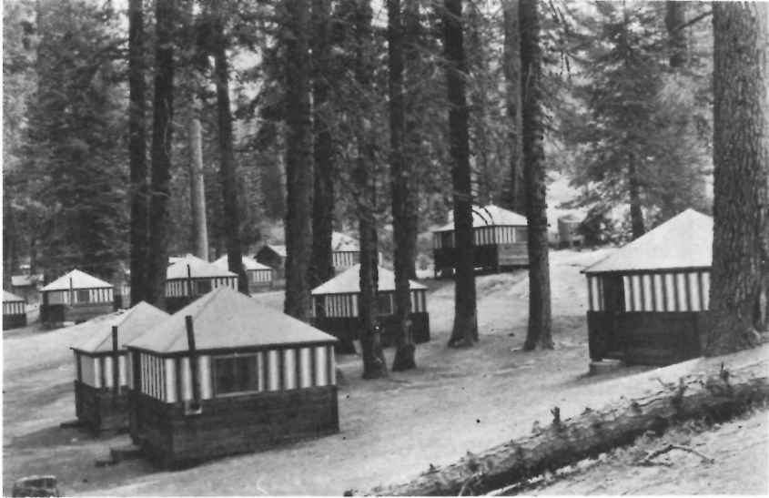
Tent cabins among the pines.

At Meadow Shelter Camp new rustic cabins, with housekeeping accommodations, are available. The rates are $1.50 a day for one or two persons and 50 cents a day for each additional person. Linen, blankets, and other camping equipment may be rented.