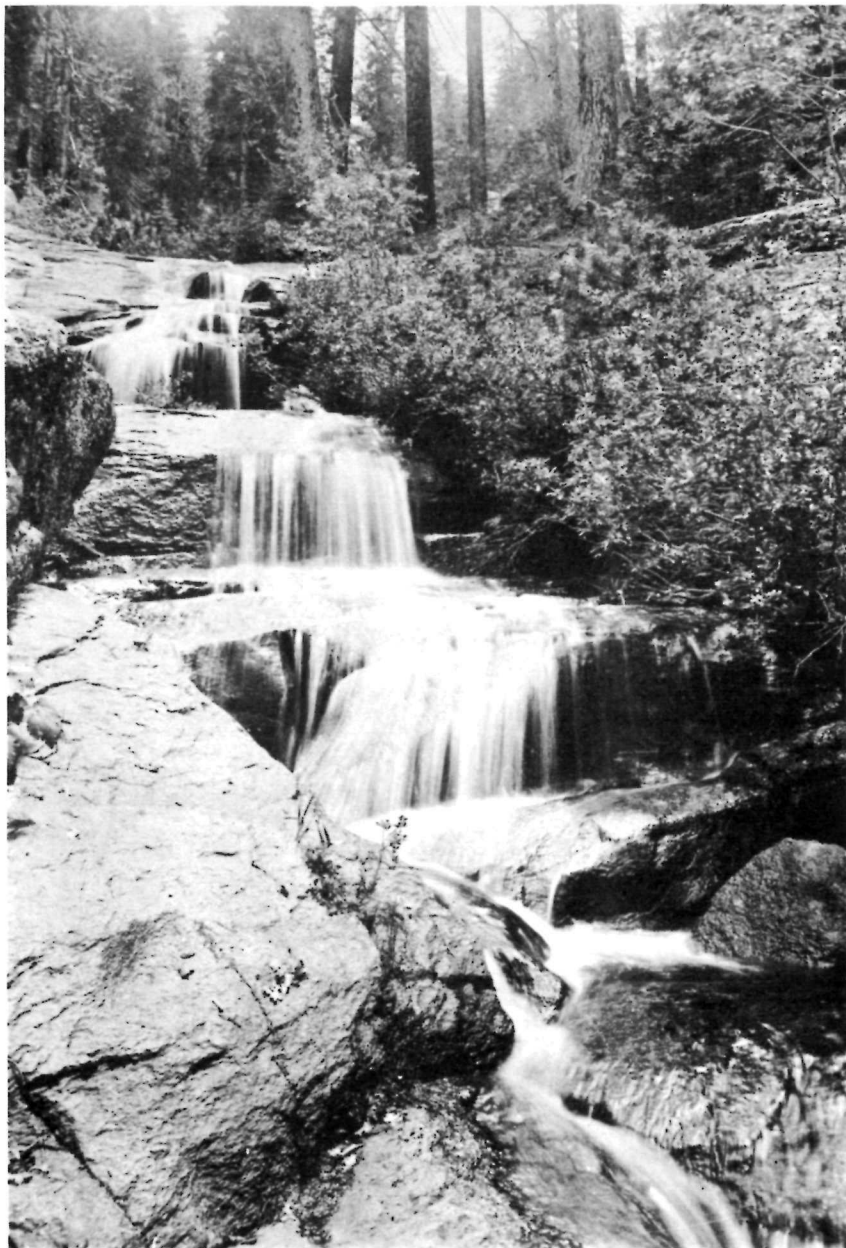
“Singing Waters” Sequoia Creek.