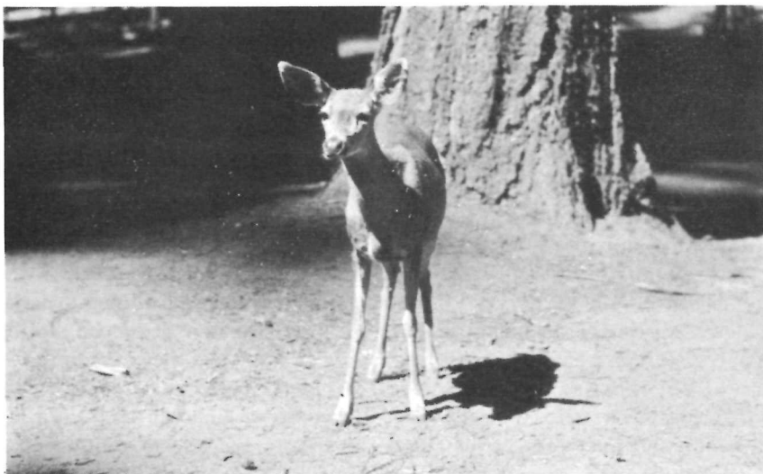
Mule deer are seen everywhere in the park.

The California mule deer, so-called because of its large ears, black bear, and several species of squirrel are the best-known animals of the park.