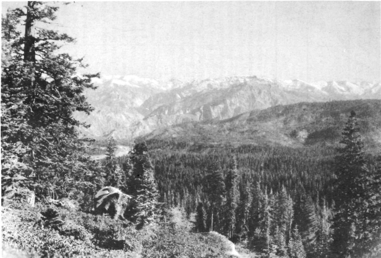
Kings River Canyon from Grant Park Ridge. High Sierra in distance.