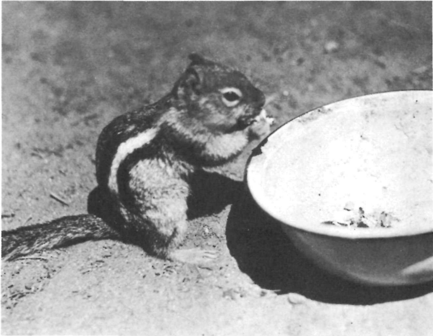
A special dinner for a golden-mantled ground squirrel.

Stalking game to see how many different animals may be noted is a popular pastime in all national parks.