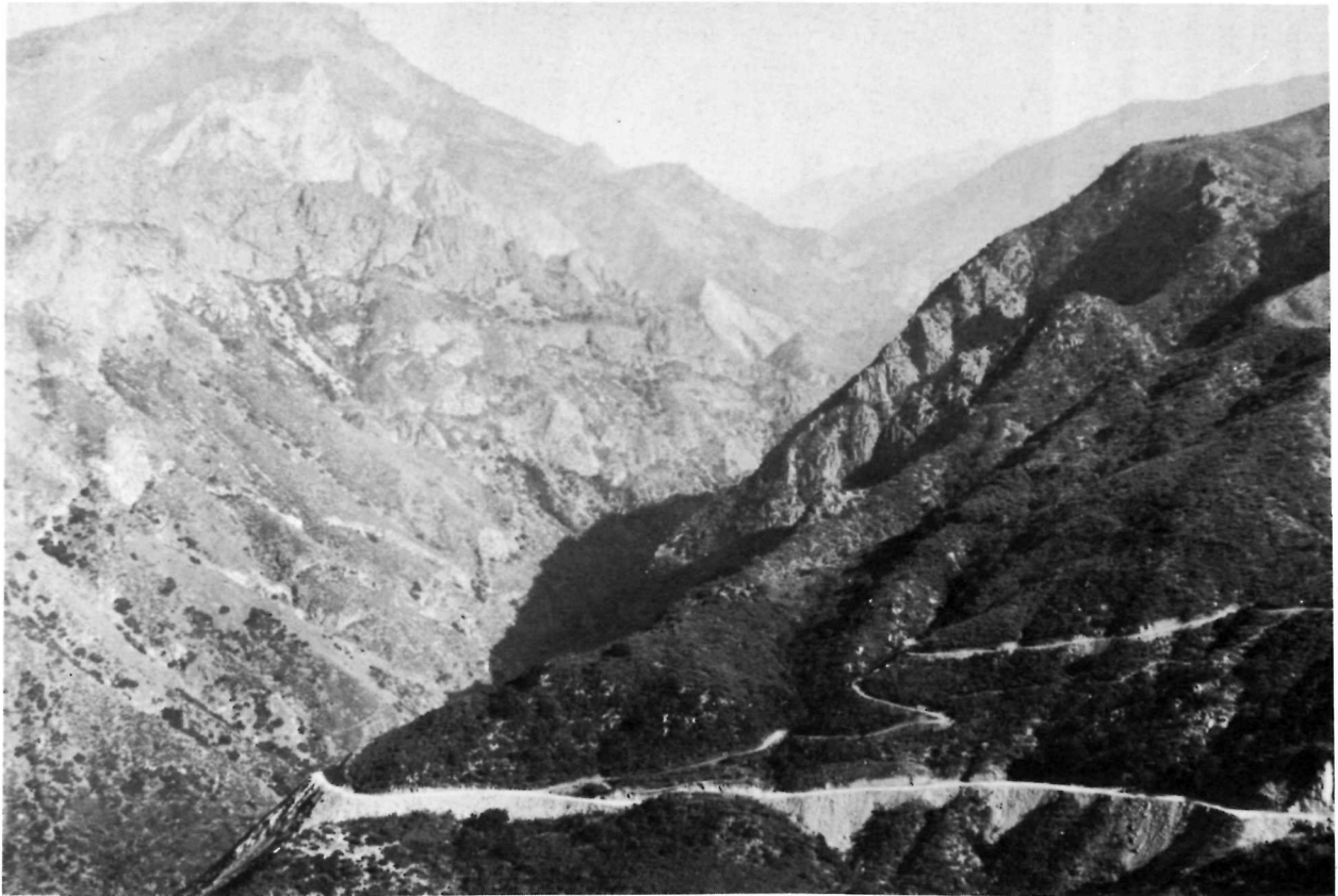
Entering gorge of lower Kings River Canyon.