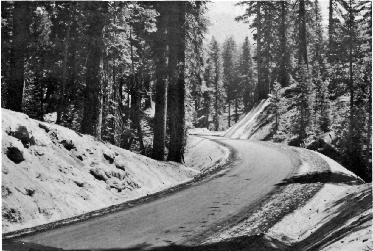
The Generals Highway.