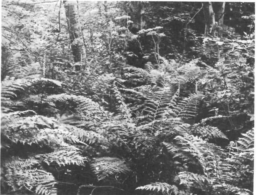
A trail-side scene.