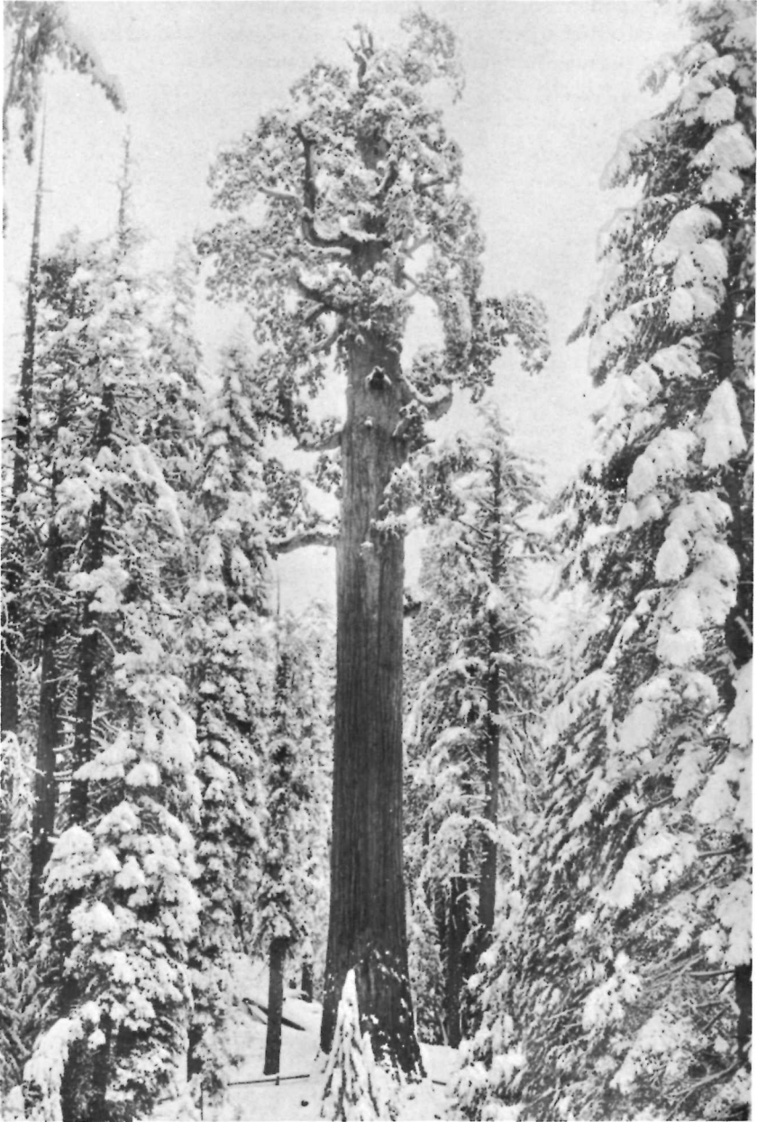
The General Grant—the Nation's Christmas Tree.