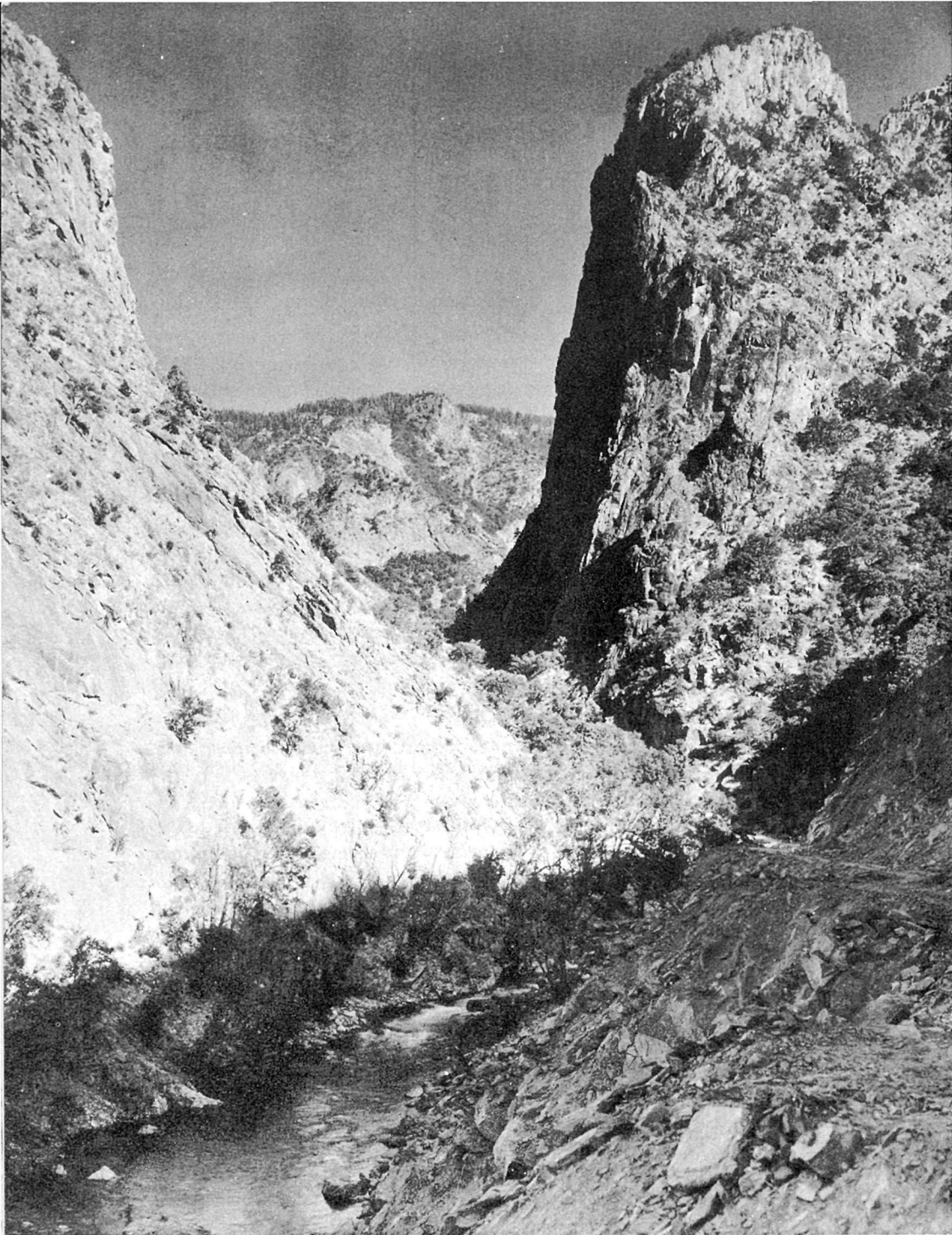
“THE GATEWAY TO THE KINGS” ON THE STATE HIGHWAY