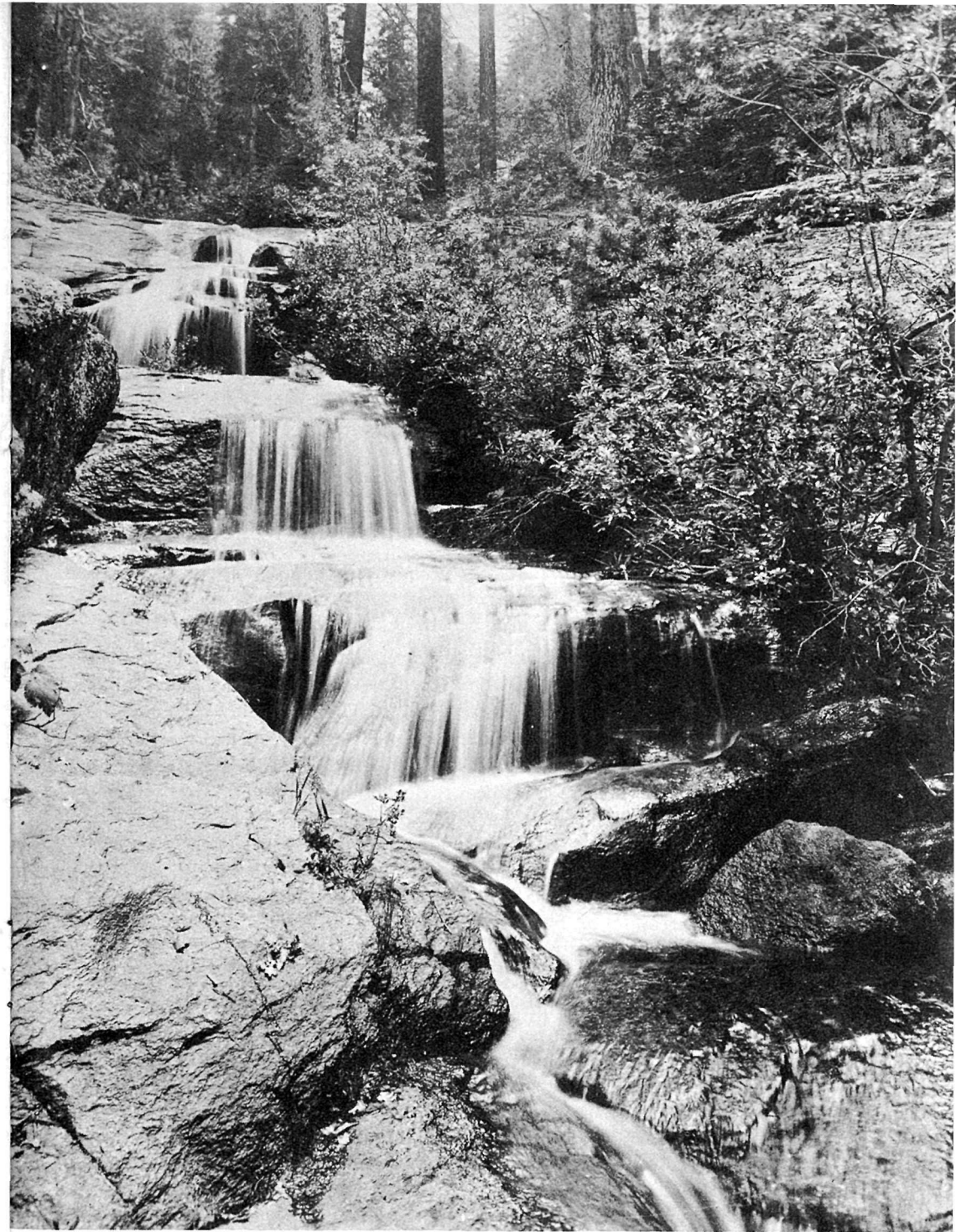
"SINGING WATERS," SEQUOIA CREEK

The Big Trees of California were named in tribute to a Cherokee Indian, who spelled his name Se-quo-yah. An uneducated, non-English-speaking Indian, he perfected a phonetic alphabet of 86 symbols with a character representing every sound in the tongue of his tribe. It was said that with this alphabet, sometimes characterized as one of the greatest ever invented, a Cherokee child might learn to read and write his native language in a day, and that within a remarkably short time after the official acceptance of the alphabet by the tribe every one of its members was able to read and write. The change brought about in the Cherokee Tribe by the introduction of this means of expressing thought on paper was remarkable. A printing press was established, type made of the various symbols, and the news of the day printed in two newspapers. Their laws were printed in Sequoyah's alphabet, and also the Gospels and many other books both useful and interesting to the Cherokee people, who thus made rapid advance in general knowledge and in civilization. During his spare time, a park ranger carved a symbolical representation of the "Spirit of Sequoyah" from