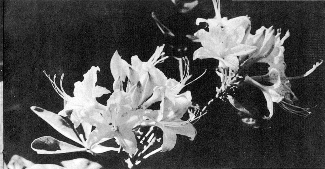
COLORFUL AZALEA BLOOMS IN PROFUSION

The California mule deer, so-called because of its large ears, black bear, and several species of squirrel are the best-known animals of the park. Deer are everywhere and so tame that many camps have especial pets for which "salt licks" are provided. Bears are found throughout the park but not in large numbers. Feeding of these animals by visitors is strictly prohibited. When this regulation is followed the bears cause very little trouble to campers. The Columbia gray squirrel is a common sight as it dashes across roads and trails, a blue-gray vision that at times appears to be all tail. The Douglas squirrel, or Sierra chickaree, gray-brown in color, is well known for its scolding habits. Large numbers inhabit the park.