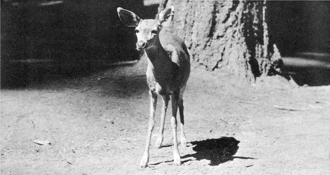
MULE DEER ARE SEEN EVERYWHERE IN THE PARK

a slab of Sequoia wood. This carving is now on display at the park administration building.