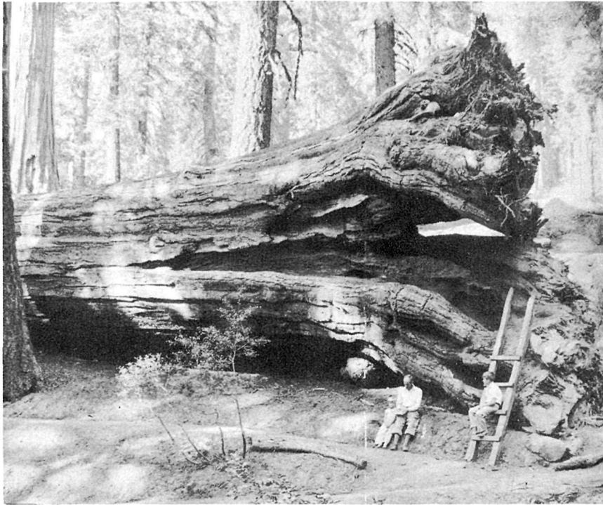
THE FALLEN MICHIGAN TREE