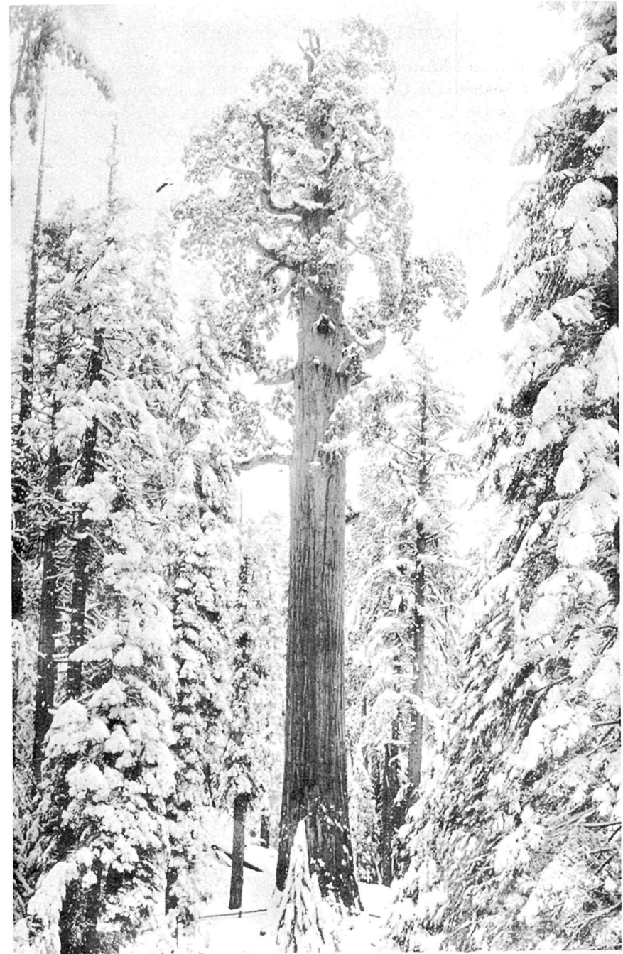
Grant Park Studio

General Grant National Park . California