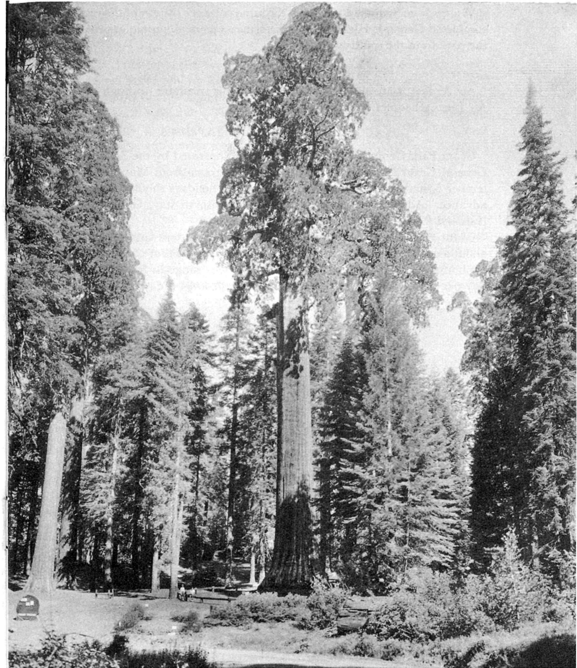
THE CALIFORNIA TREE

General Grant National Park . California