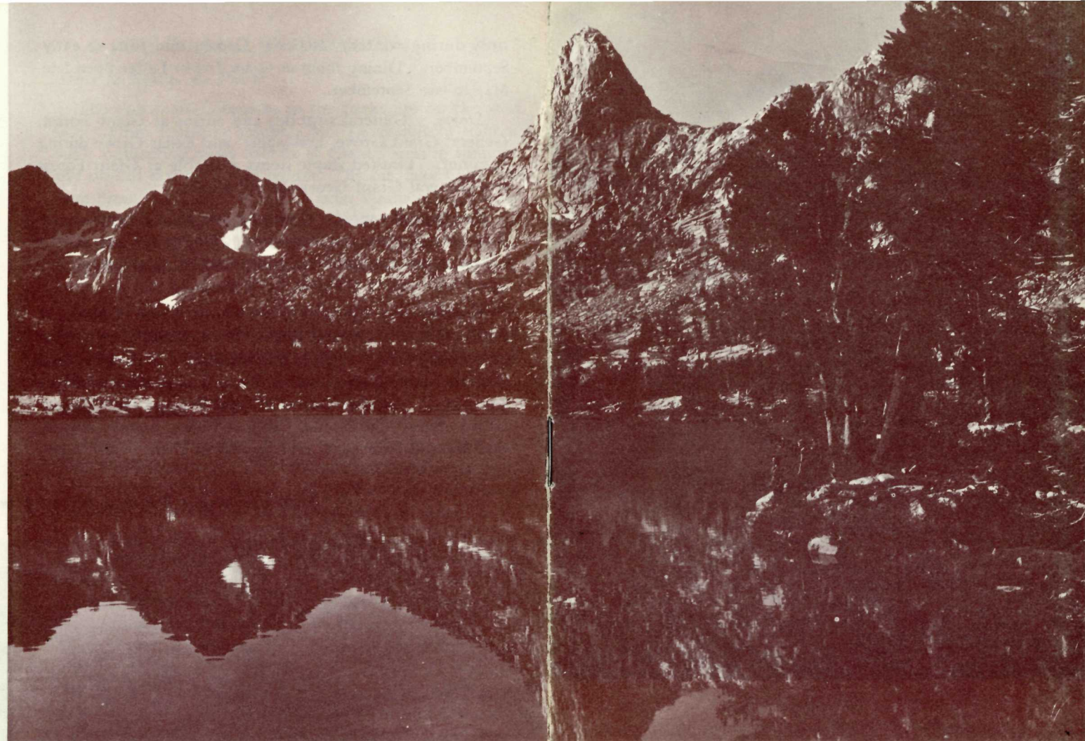
Rae Lakes and Fin Dome, Kings Canyon National Park