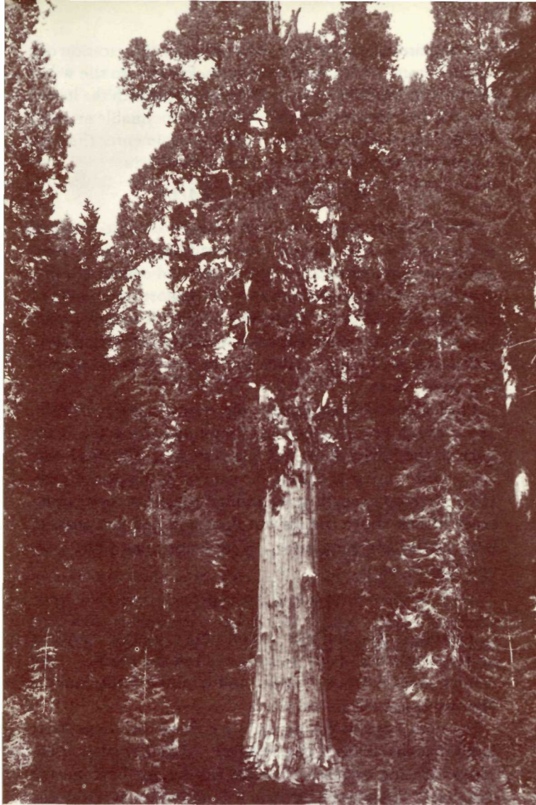
General Sherman Tree, Sequoia National Park

and fur traders. On John C. Frémont's third expedition to the West in 1845, a section of his party traveled along the Kern River, which he later named for his topographer. The Indians had called it Pu-sun-co-la. Spanish explorers discovered and named the Kings River. They called it Rio de los Santos Reyes—River of the Holy Kings.