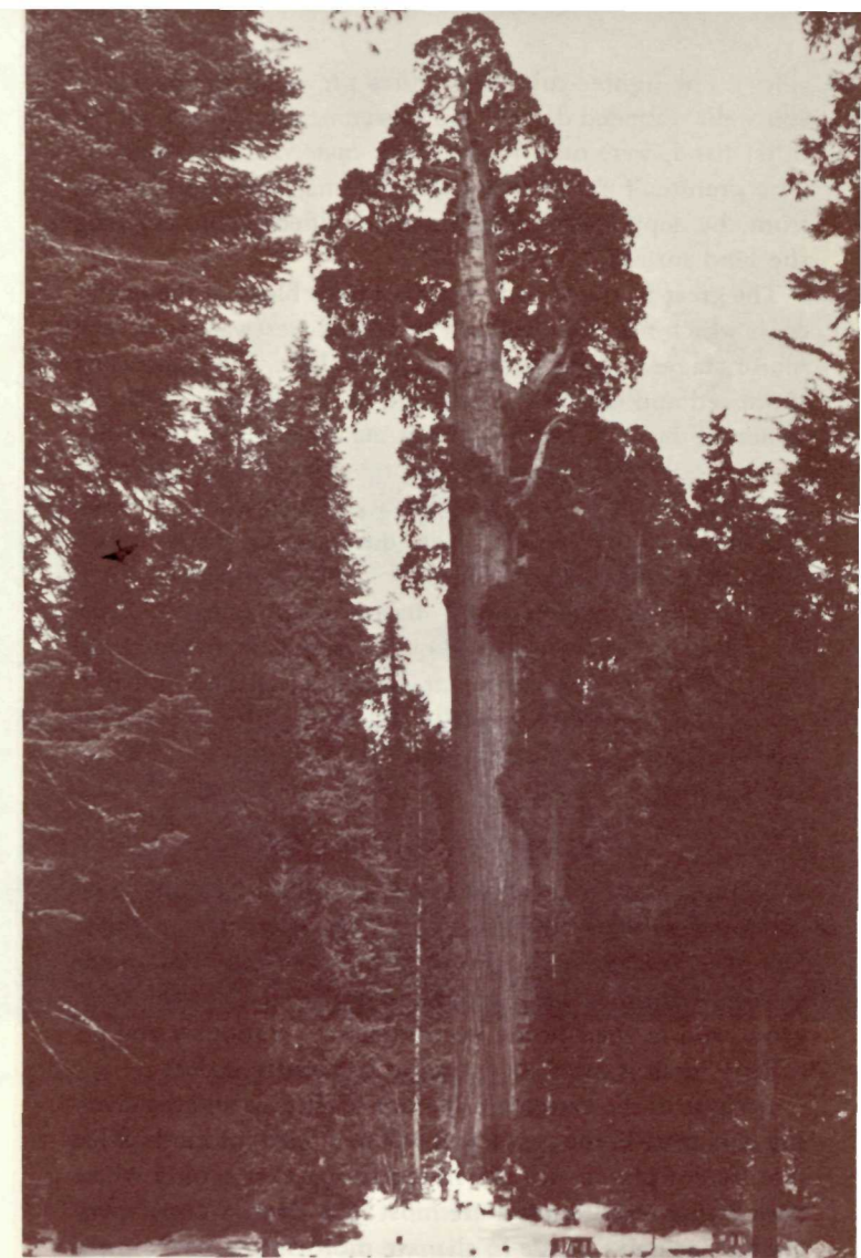
General Grant Tree, Kings Canyon National Park

Community life. Invariably the giant sequoias live in association with other trees—in forest communities, where they are scattered individually and in groups. The forest floor is often covered with lupine, dogwood, azalea, alder, and willow. Giant sequoias, with firs and pines, blend harmoniously into the forest community; but note how strikingly different the ages-old sequoias are from their neighbors. Massive and vigorous, they are the patriarchs of the community. Spanning the ages, they seem to serve as a link with eternity.