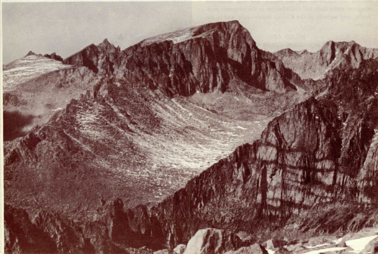
Sequoia's Mount Whitney, highest point in the United States outside Alaska

A superintendent, whose address is Sequoia and Kings Canyon National Parks, Three Rivers, Calif., 93271, is in immediate charge of the parks. His headquarters are near Ash Mountain Entrance Sequoia National Park.