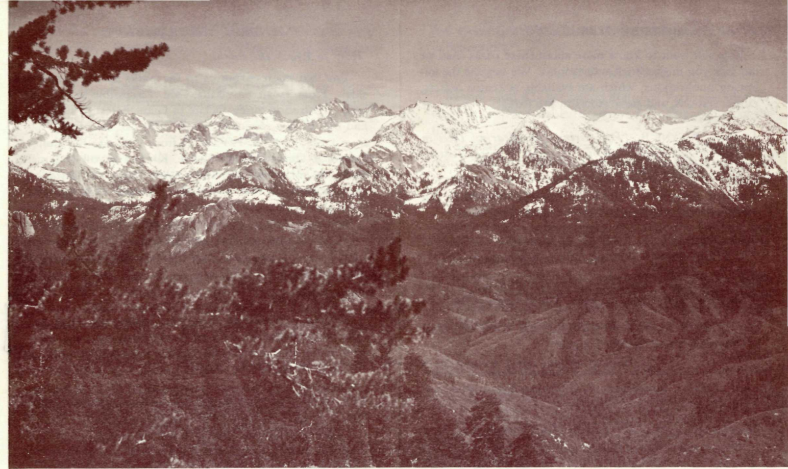
The Great Western Divide in the High Sierra, from Moro Rock, Sequoia National Park

The United States was the first country in the world to set aside an area of great natural beauty as a National Park for all to enjoy. The first park—Yellowstone, established in 1872, "as a public park or pleasuring-ground for the benefit and enjoyment of the people"—was followed by others, similarly marked for preservation and enjoyment. The movement spread to other countries. Now, many nations have such parks for their people. Though our own park