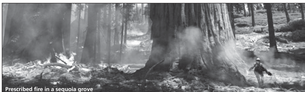
Prescribed fire in a sequoia grove

The park staff uses such actions as tools to maintain the landscape and protect its inhabitants and visitors. Your visit gives you but a snapshot of this process; Nature decides the timing of many of these actions. They all share one goal: preservation of these parks for us all, now and in the future.