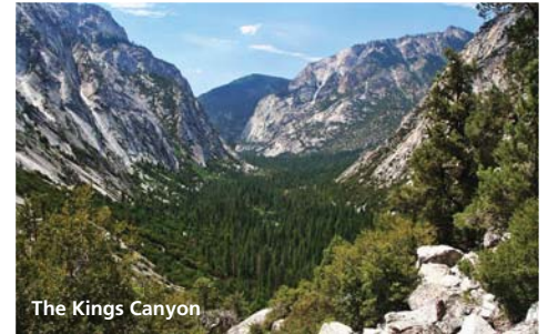
The Kings Canyon

A 1916 tower, still used for spotting fires, offers 360° views. Approximately 6 miles (9.6 km) off Big Meadows Road 14S11, then take Forest Road 13So4.