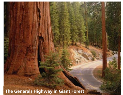
The Generals Highway in Giant Forest

South of the Giant Forest, this turnout offers views to the west over the foothills and the distant valley.