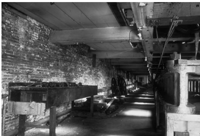
Lowell National Historical Park, Massachusetts.

the Cane River National Heritage Area features Creole and other southern cultures in a rural Louisiana setting, while the Lackawanna Valley area in northeastern Pennsylvania reveals the history and culture of a coal mining and industrial region. Such new kinds of areas involving cultural and social history have helped advance another Park Service trend that has affected most areas of the nation-