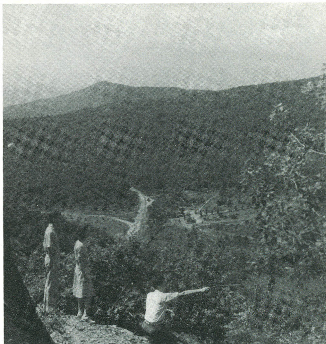
Seeing the park from the trails

There is a wealth of butterflies and moths, beetles, and other