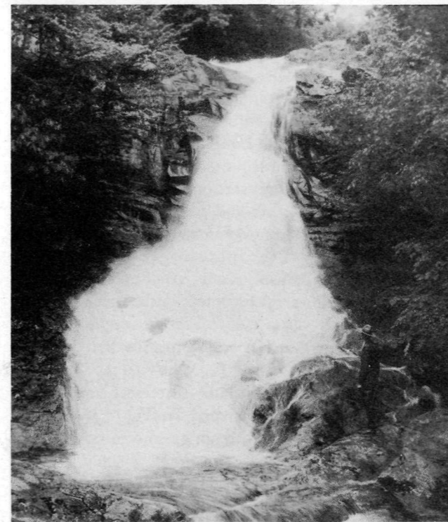
The falls in White Oak Canyon may be reached by a well-graded foot trail

Shenandoah National Park is administered by the National Park Service, United States Department of the Interior. Communications regarding the park should be addressed to the Superintendent, Shenandoah National Park, Luray, Va. The administrative offices are located at park headquarters on the Lee Highway (U S 211), 4 miles west of Thornton Gap.