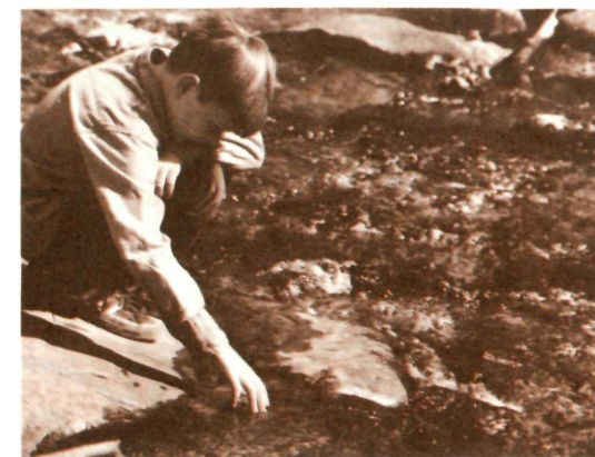
Shenandoah has three National Environmental Study Areas (NESA) for school class use.

At peace with the ages, the wilderness heights of the Blue Ridge lie in quiet repose above the pastoral beauty of the Shenandoah Valley.