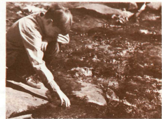
Shenandoah has three National Environmental Study Areas (NESA) for school class use.

At peace with the ages, the wilderness heights of the Blue Ridge lie in quiet repose above the pastoral beauty of the Shenandoah Valley.