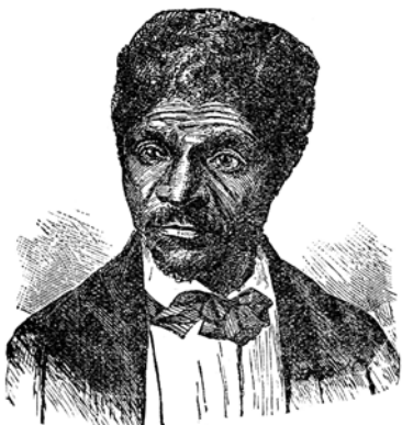
Dred Scott, subject of a notorious Supreme Court decision.

The party was the first in the nation's history to draw its support from one section only. Inevitably, the party aroused deep anger in the South. Attitudes in the two sections of the nation continued to harden in the late 1850s. In 1857, the U.S. Supreme Court in the Dred Scott decision ruled that Americans of African descent were not U.S. citizens. A failed effort to start a slave uprising in