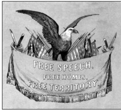
Republican Party slogan from the 1860 election.

with this view. Many Northerners opposed its presence in the territories, which were viewed as the birthright of ambitious, free white men. The proposed admission of Missouri as a slave state in 1820 provoked a national debate over slavery. After much discussion, the 1820 Missouri Compromise was worked out. Under its terms, Maine was admitted as a free state at the same