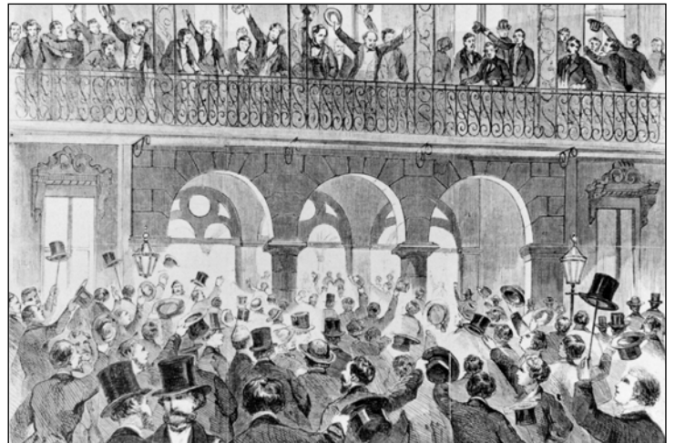
A secession meeting in Charleston, South Carolina.

One by one, seven states — South Carolina, Mississippi, Florida, Georgia, Alabama, Louisiana, and Texas — left the Union. Lincoln hoped desperately to maintain the Union without war. When he decided to resupply the U.S. army at Ft. Sumter in Charleston Harbor, Confederate forces fired on the fort. Lincoln then asked for 75,000 volunteers to put down the rebellion. This prompted Virginia, North Carolina, Tennessee, and Arkansas to join the Confederacy. Civil war had come.