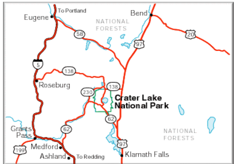
Figure 1. Crater Lake National Park and the region

Crater Lake National Park was created in 1902 to protect the volcanic lake, created by the eruption and collapse of Mt. Mazama around 7,000 years ago in south central Oregon. The park offers year-round recreation activities. Around two thirds of its summer visitors come from other states, mainly California and Washington (Visitor Service Project, 2001). Three gateway communities, Roseburg, Klamath and Medford, are about an hour driving distance away. The park is also about an hour driving distance to Interstate Highway 5 where it connects to Washington and California.