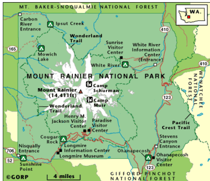
Figure 1. Mount Rainier National Park

Mount Rainier National Park was established in 1899 to protect the natural resources of the southwest Cascade Range of Washington State. It is the fifth oldest national park in the US, encompasses 235,625 acres and is located about 100 kilometers (50 miles) southeast of the Seattle-Tacoma metropolitan area, which contains over two million people. The Park is approximately 97 percent wilderness and 3 percent National Historic Landmark District. With the greatest single-peak glacial system in the United States, Mount Rainier is famous for mountain climbing and other recreational activities year round.