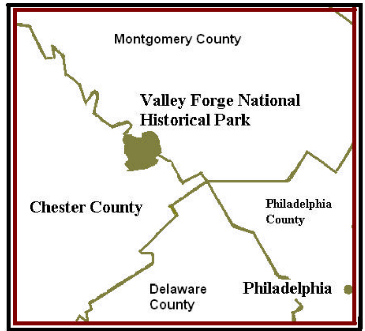
Figure 1. Valley Forge NHP, PA

Valley Forge NHP is located at Chester County, southeast Pennsylvania (Figure 1). The population of Chester County in 2000 was 433,501 with an average income per capita of $46,757. Total personal income was $20.4 billion, and total full-time and part-time employment was 285,209 jobs (Bureau of Economic Analysis, 2002). The services sector was the primary economic base of Chester County (Table 2). It accounts for 30% of total personal income and 35% of total jobs. The restaurant sector generated $172 million in personal income in 2000, followed by amusement and recreation service ($54 million), and the lodging sector ($32 million).