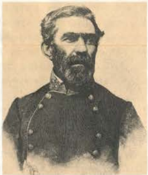
Gen. Braxton Bragg