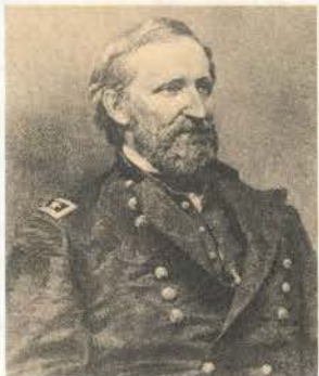
Maj. Gen. William S. Rosecrans