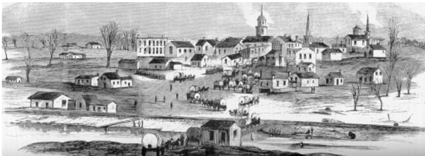
Harper's Pictorial History of the Civil War, 1866

Evergreen Cemetery, 519 Greenland Drive, Murfreesboro, TN 37130, (615) 893-5641