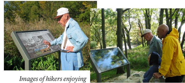
Images of hikers enjoying the Bottomland Trail