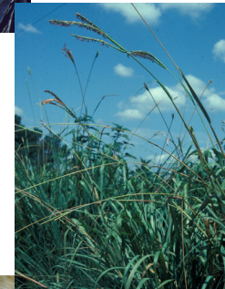
Eastern gama grass