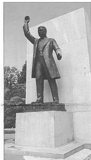
Statue of Theodore Roosevelt, Theodore Roosevelt Island, Washington, DC c. 1967

Right: President Roosevelt (left) with famous naturalist John Muir at Yosemite National Park in 1903