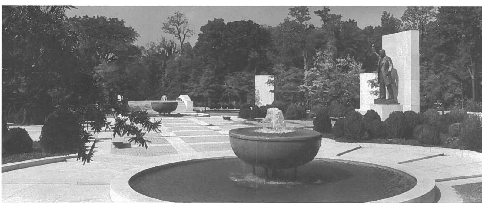
Theodore Roosevelt Memorial, c. 1967