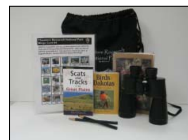
Family Fun Pack

Theodore Roosevelt National Park offers a great tool to help potential Junior Rangers and their families explore the park: the Family Fun Pack. Families can check out the packs for 24 hours at either the North or South Unit Visitor Center at no charge. Each pack contains a pair of binoculars, magnifying glasses, guidebooks, and activities for all ages. Visitors are encouraged to check out a Fun Pack, even if no one in their group is participating in the Junior Ranger program.