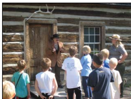
Junior Rangers enjoying a ranger program

leading by example and continuing to explore all that national parks have to offer. After taking the pledge, children receive Junior Ranger badges signifying their hard work and dedication to the park.