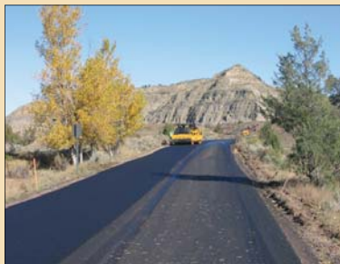
Paving park roads is one way we may use your fee money

unable to keep up. In an attempt to address this shortfall, Congress passed the Federal Lands Recreational Enhancement Act, which helps spread