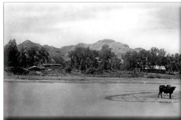
Elkhorn Ranch taken by Theodore Roosevelt, 1886

There are no food services available in the park. The town of Watford City (15 miles north) has a variety of options open year round.