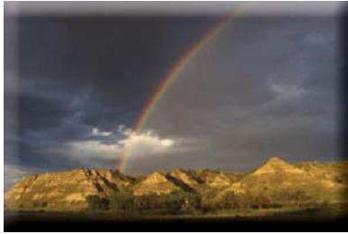
Rainbow over the Badlands

feral horses, mule deer, and white-tailed deer are commonly seen along the route. Visitors will experience a variety of