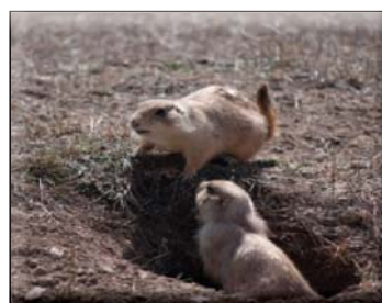
Black-Tailed Prairie Dog

Black-tailed prairie dogs are the park's most gregarious residents. They live in large towns composed of many families. Their antics are sure to amuse visitors of all ages. The South Unit Scenic Loop Drive passes through several large prairie dog towns, making them hot spots for wildlife viewing.