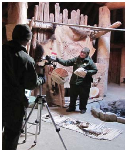
Rangers presenting a live Earthlodge program

A wide variety of programs focusing on the Hidatsa, Mandan, and Arikara cultures, as well as other historical, cultural, and natural history topics can be tailored to your curriculum. For additional information about program topics and details for broadcasting, please visit the "For Teachers" section of the