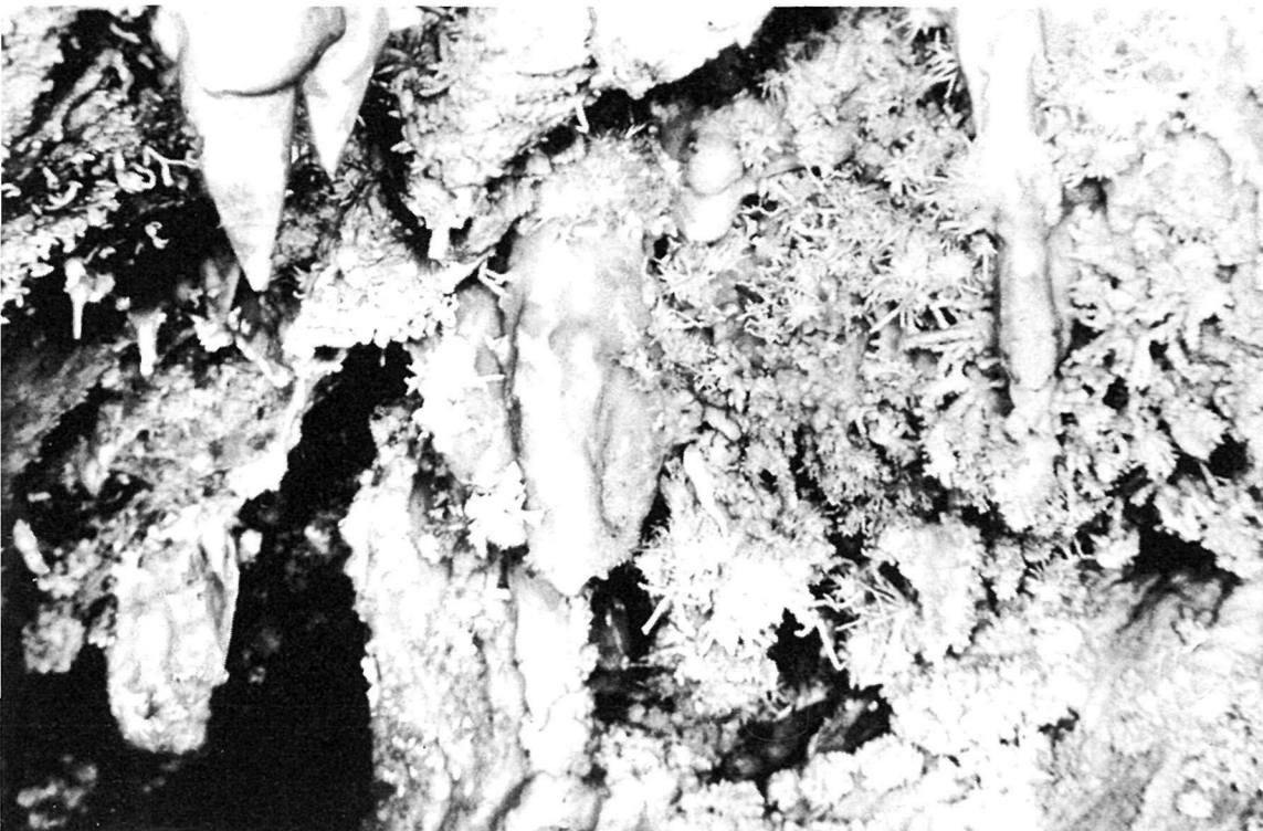
The Coral Gardens, a typical example of helictites in Timpanogos Cave