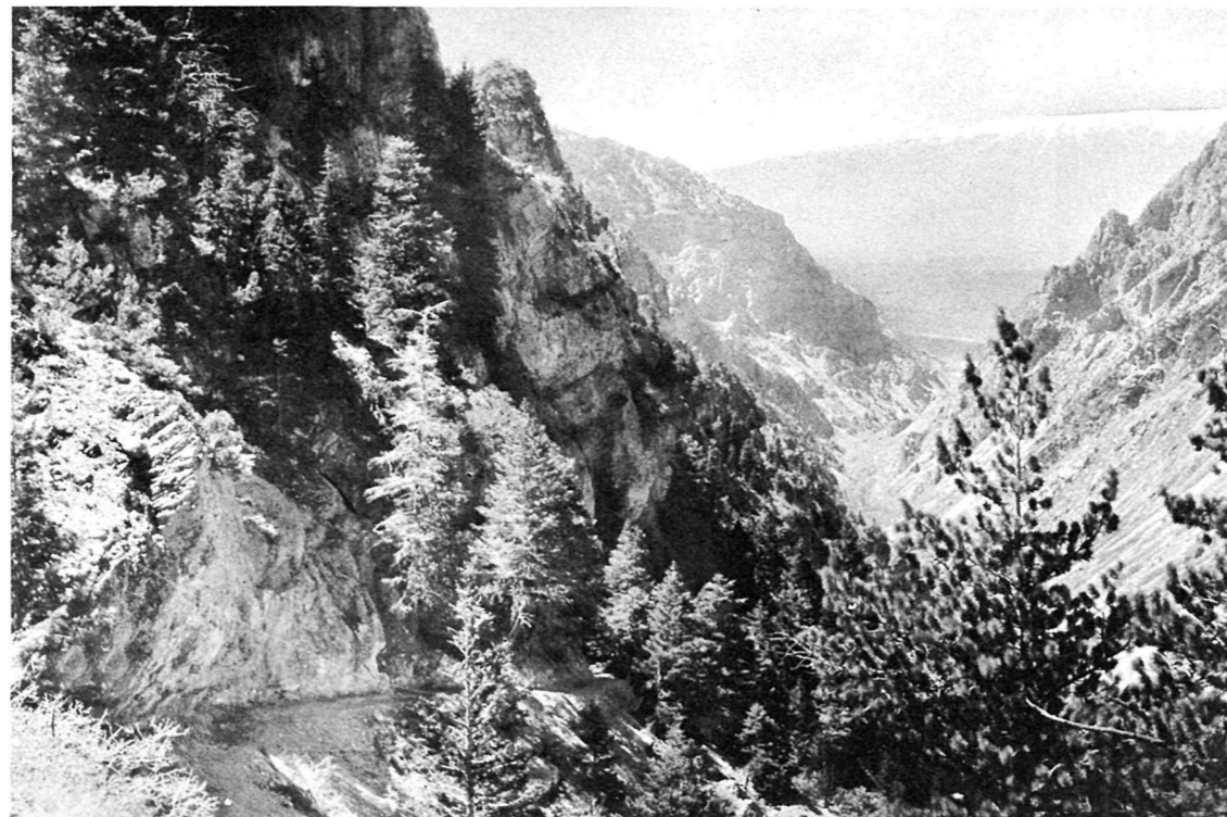
Scene along the trail to entrance of Timpanogos Cave