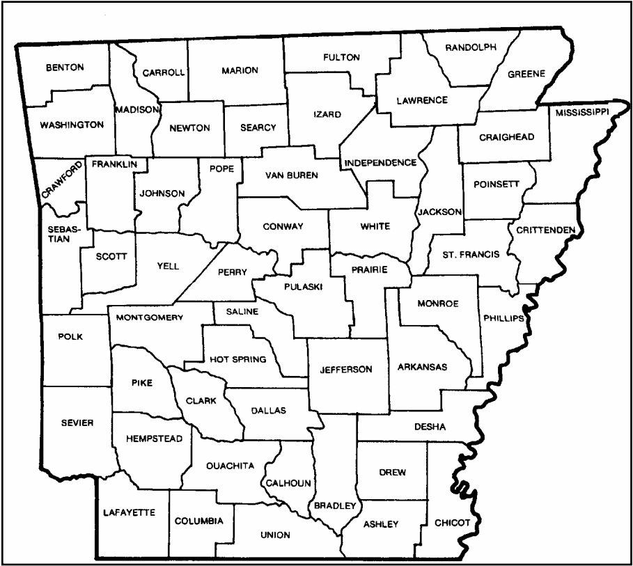
Counties in 1860