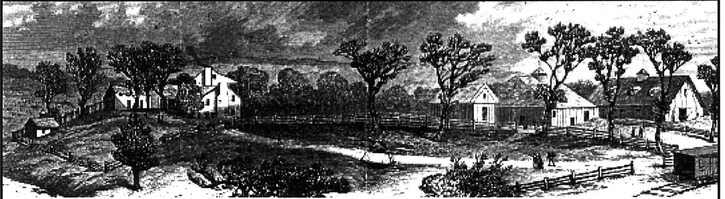
"President Grant's Farm Near St. Louis" from Frank Leslie's Illustrated Newspaper , October 16, 1875.

National Historic Site National Park Service U.S. Department of the Interior