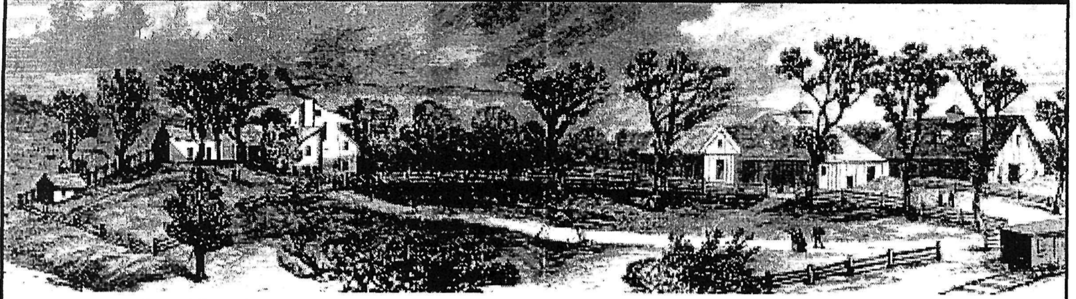
"President Grant's Farm Near St. Louis" from Frank Leslie's Illustrated Newspaper , October 16, 1875.

National Historic Site National Park Service U.S. Department of the Interior