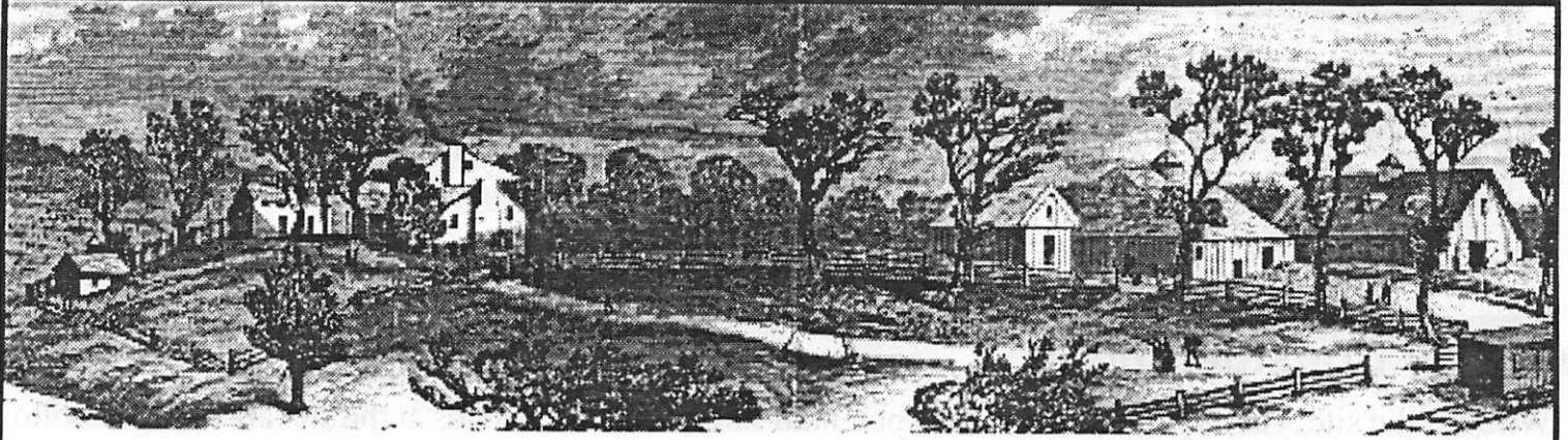
"President Grant's Farm Near St. Louis" from Frank Leslie's Illustrated Newspaper , October 16, 1875.

National Historic Site National Park Service U.S. Department of the Interior