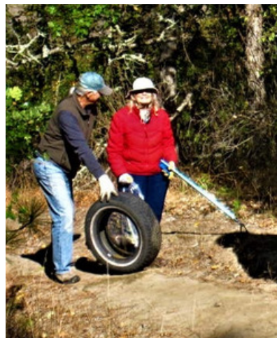
NPLD volunteers remove tire from Klickitat Trail