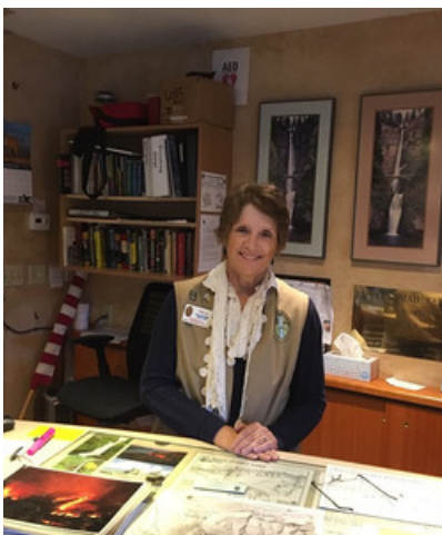
FOMF volunteer staffs front desk at Multnomah Falls

We celebrated National Public Lands Day by hosting a cleanup on the Klickitat Wild and Scenic River and along Klickitat Trail . Over 40 volunteers, including a high school honors class, showed up to lend a hand. Notable items removed included toxic railroad ties that were perilously close to entering the Klickitat River. All together, the volunteers donated 156 hours of their time to clean up 800 pounds of trash.