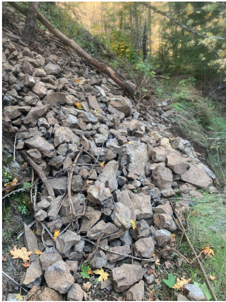
Recent slide on Eagle Creek Trail

Sadly, it's time to say farewell to our seasonal trail crew members. They did manage to pull off one last exciting feat before leaving for the year -- clearing a fresh slide off Eagle Creek Trail . We know everyone is anxiously awaiting the re-opening of this glorious trail, but we can't provide a specific timeline yet. We are close to having new trail bridges installed at Fern Creek and High Creek , but rock slides will only pick up in the coming winter months. So, even after the bridges are installed, more monitoring and prep work will be needed before we can estimate our timeframe for reopening.