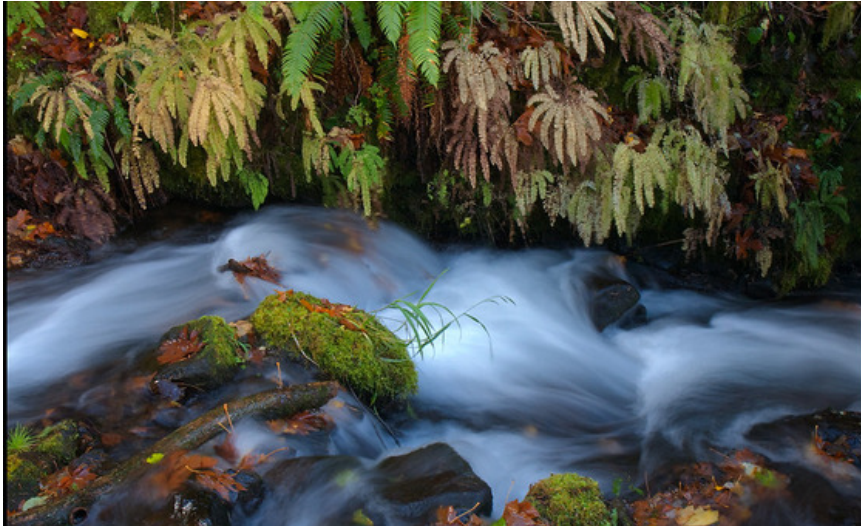
Fall colors along Wahkeena creek