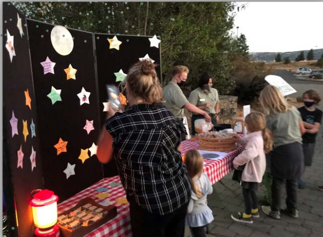
Above: Family members write their reflections of the summer and post them on the "Night Sky" display.

On September 20th, nearly one hundred visitors gathered at the Columbia Gorge Discovery Center in The Dalles for a walk outside to view and celebrate the Harvest Moon. Forest Service Field Rangers Steven, Ellen, and Jay greeted the families with apple cider and moon pies, followed by an activity exploring the significance of the Harvest Moon to cultures around the world.