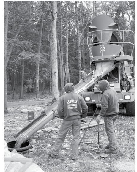
Pouring the footings.

Support for this project has been provided by the U.S. Forest Service; Grey Towers Heritage Association; Pennsylvania Department of