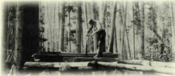
Whipsawing logs at the Lochsa Ranger Station, 1928.

The buildings at the Lochsa Historical Ranger Station were built primarily from native materials. Anything not locally available was packed in by horse or mule. Most of the original buildings remain in use today.