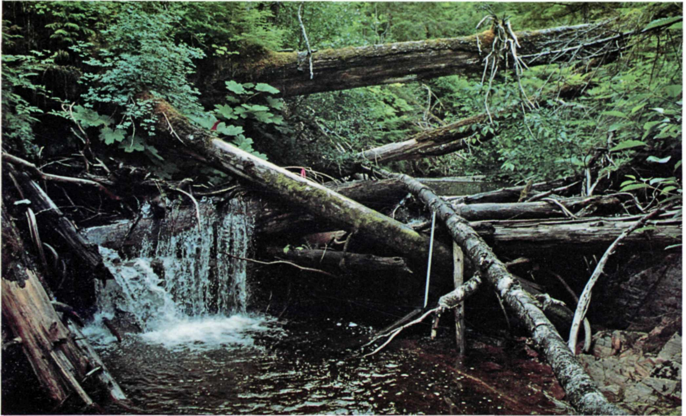
Pools are formed as the stream scours and fills in around the debris.