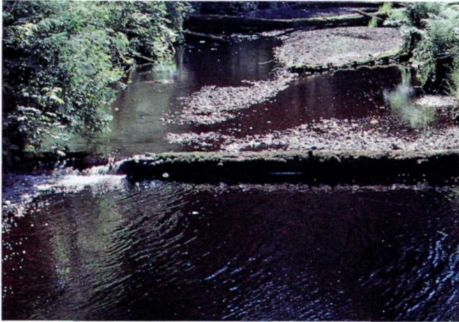
Left Dams or scour pools may be formed by logs or trees extending across the channel.