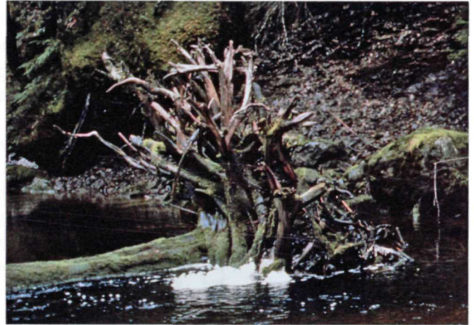
Right Root wad and stem form midchannel pools.