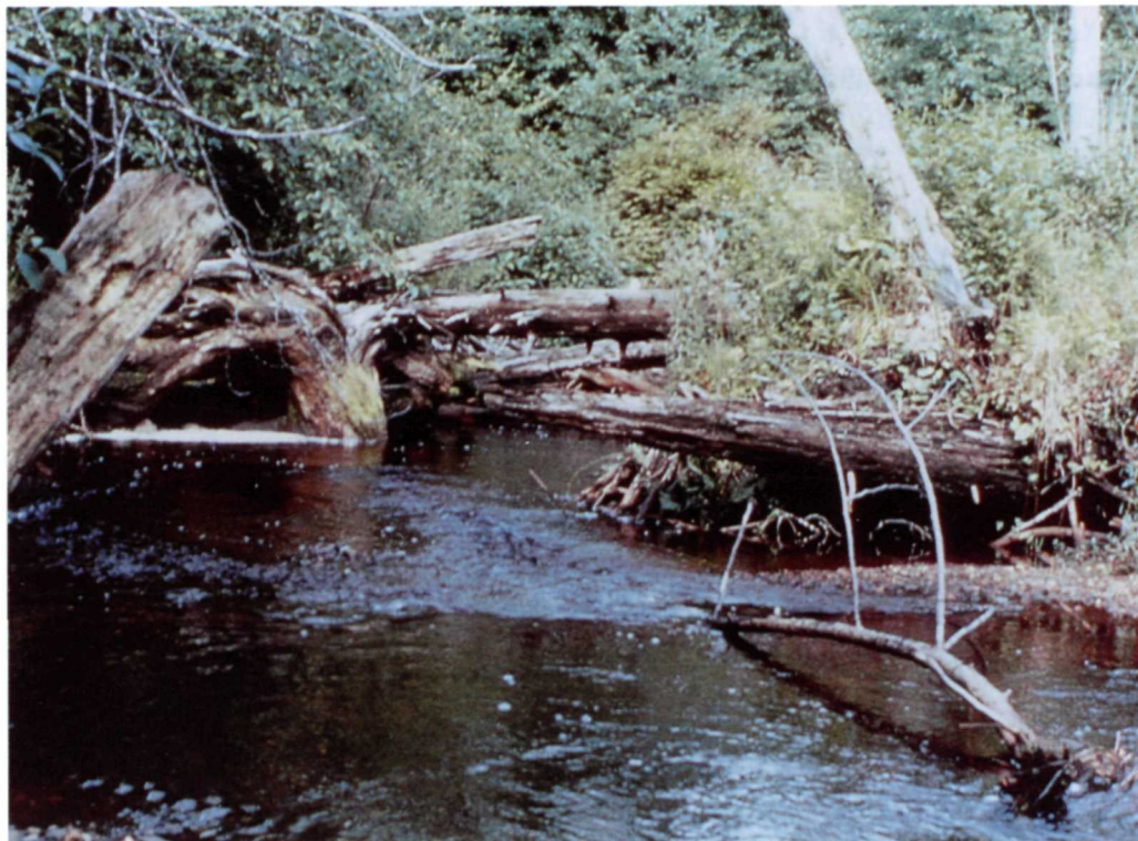
Shape and stability of the channel is affected by debris which controls the shape of the stream, scouring and filling in around the debris.