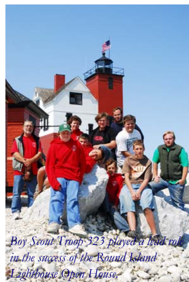
Boy Scout Troop 323 played a lead role in the success of the Round Island Lighthouse Open House.