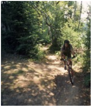
The Tour da Woods ride includes a youth event, Tour da Valley.

The Lands program has negotiated several acquisitions (particularly in-holdings) that conserve the integrity of undeveloped lands and protect habitat quality.