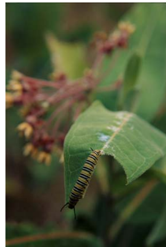
Peninsula Point is a gathering place for Monarch Butterflies as they migrate south each August.

Hanley Field Exchange – The Forest continues to work with Alger County regarding possibilities for land exchange. The county is interested in acquiring the Hanley Field Airport. Senator Levin’s office is tracking this issue.