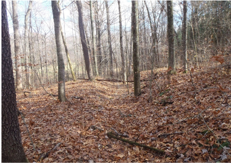
Figure 2. Overview of 12Or856, a segment of the Buffalo Trace identified by ASC Group.