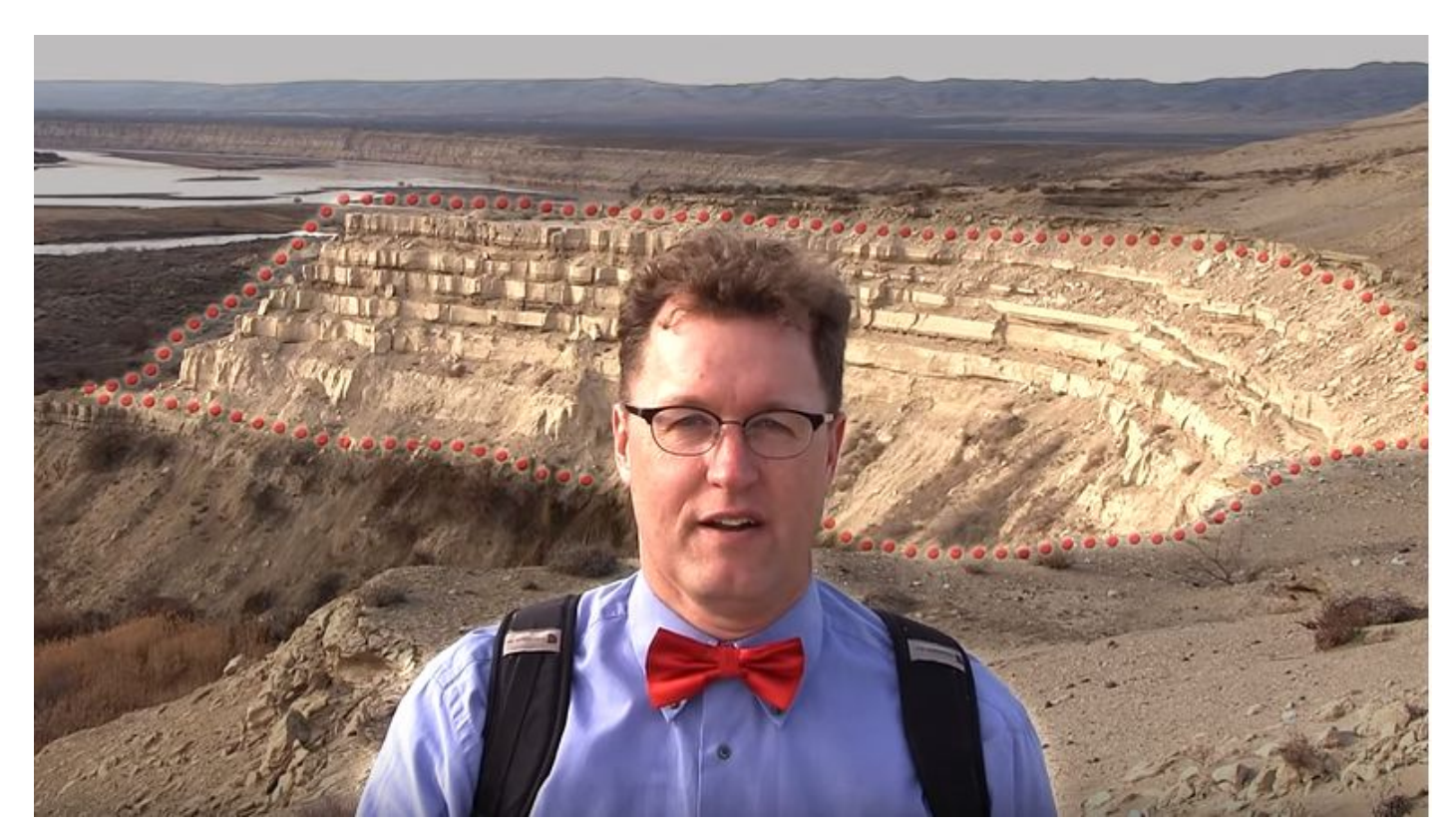
Learn more from Nick Zentner's 2-Minute Geology video - The White Bluffs at Hanford Reach

Up to about a dozen rhythmites, composed mostly of sand from as many floods, occur within the channel fill. At the top of most rhythmites is a layer of wind-blown sand suggesting a period of dryness separated each flood. Sediment thicknesses and sedimentary structures in each of the beds give a sense of the tremendous sediment load and the relatively calm conditions of the ponded flood waters.