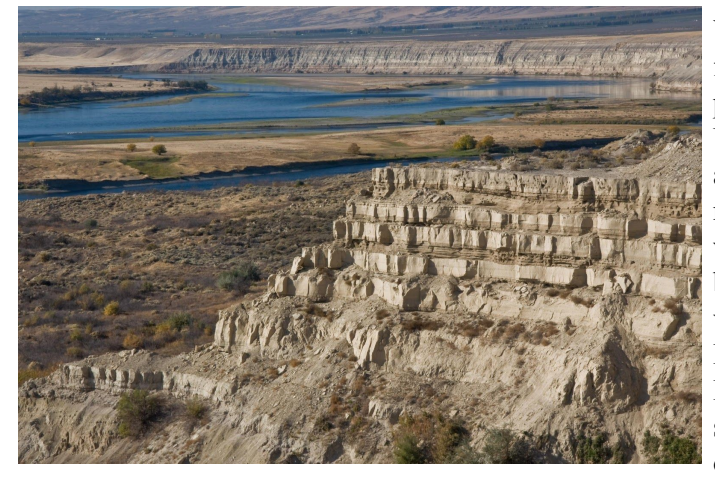
rhythmites were forming.

You can see up to 15 regularly spaced, banded slackwater flood rhythmites ahead in the distance, which fill a paleochannel carved into the Ringold Formation (Figure 2). Underfoot, on the other hand, only a few thin rhythmites are present here at the margin of the paleochannel. Most rhythmites are covered with a thick pile of younger windblown sand. As you go northward, the rhythmites will become more obvious. Lots of ice-rafted erratics are visible at or above the contact between the Ringold Formation (below) and the rhythmites (above). The Ringold Formation here consists of only fine-grained clay, silt and sand. Any gravel you see here must have rafted in on icebergs during Ice Age flooding at the same time the