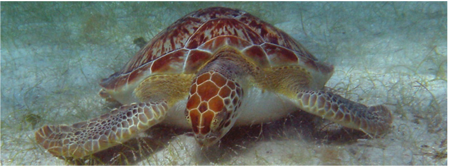
Photo Above: The Environmental Assessment also prescribes mitigation measures to help with natural and cultural resource protection for sensitive species, such as the federally threatened green sea turtle.