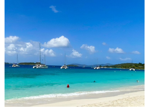
Photo Above: Caneel Bay is a popular destination for sailors in St. John.