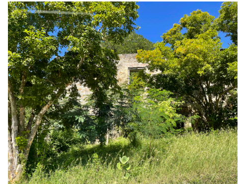
Photo Above: Overgrown vegetation surrounding the ruins associated with the Caneel Bay Plantation