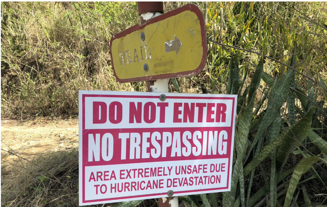
Photo Left: Access to most of the Caneel Bay area has been restricted due to unsafe conditions following the 2017 hurricanes.

The NPS would stabilize some historic buildings affected by the hurricane damage and subsequent deterioration to meet the NPS's responsibilities for historic preservation and visitor safety. The historic structures would be left in place where possible, and their forms and outlines would be maintained. Existing trails and viewing area(s) may be rehabilitated, and information on site hazards would be provided for public safety, education, and protection of the site. Existing roadways would be minimally maintained and provide hiking access only to viewing areas and beaches. Administrative use of the roads by NPS vehicles would be allowed.