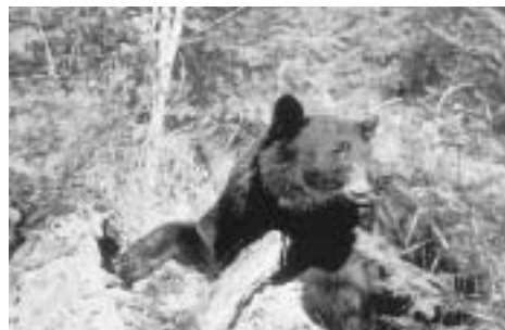
BLACK BEARS GET THEIR PROTEIN BY EATING INSECTS SUCH AS ANTS, HORNETS, AND ANIMAL MATTER.

that has an odor (toothpaste, bug repellent, soap, garbage, etc.).