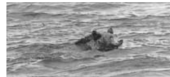
BLACK BEARS ARE EXCELLENT SWIMMERS.

The solution is prevention. Help bears keep their fear of humans and stay alive by changing your habits.