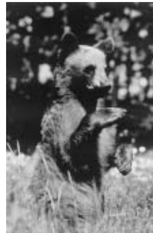
CINNAMON COLORED BLACK BEAR.

Black bears ( Ursus americanus ) are the smallest yet most abundant bear on the North American continent. The only bear found in Minnesota, they are quite