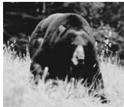
BLACK BEAR "BLUFF CHARGING."