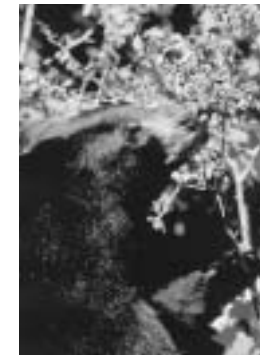
BLACK BEAR FEASTING ON LUSCIOUS BERRIES.

Considering their nature and extremely acute senses, it is not surprising that they are often attracted to human food sources — like garbage and camper's picnics!