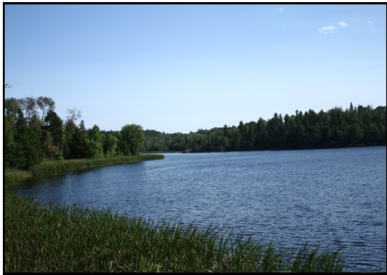
Blind Ash Bay

The Blind Ash Bay Trail has many birds for viewing – usually in June. The species listed in this brochure have been heard or spotted since 1997.