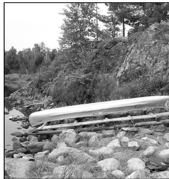
Ek Lake canoe

A guide to the boats and canoes available to visitors on the interior lakes of the Kabetogama Peninsula in Voyageurs National Park.