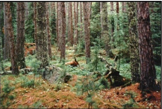
An open, mature mixed pine forest on a ridge top

Dryweed Island area has many birds for viewing – usually in June. The species listed in this brochure have been heard or spotted since 1998.