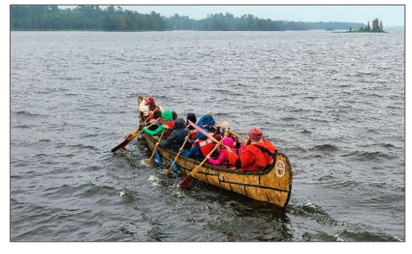
A North Canoe Trip on the waters of the park.