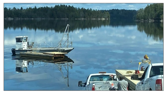
A Maintenance boat departing the Ash River Administrative Dock.