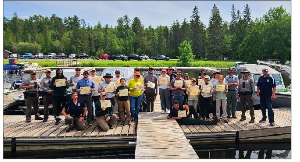
The MOCC class on the dock at the Kabetogama Lake Visitor Center.

As of June, the Kabetogama Lake Visitor Center now has public WiFi available in addition to the Ash River Visitor Center.