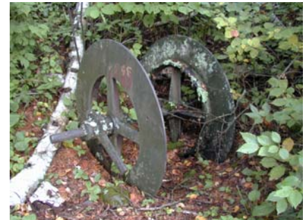
Wheel belonging to winch on Little American Island

Little American Island is one of the park's 15 Visitor Destinations and is open to the public.