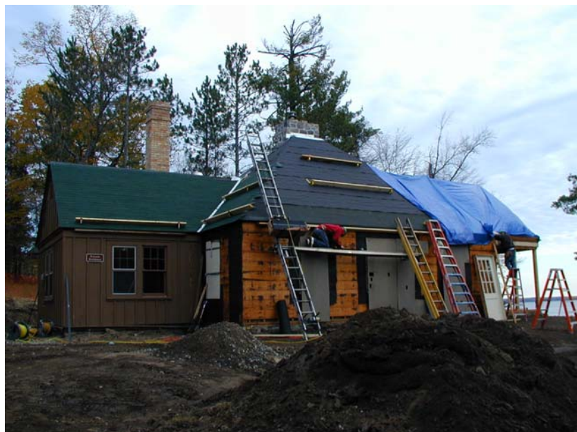
Kabetogama Lake Ranger Station, Fall 2008