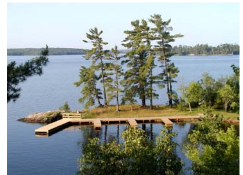
Kabetogama Lake Group Campsite

The Campsite Committee is in the process of developing a plan to better serve visitors who travel in the park by canoe or kayak because the needs of the paddling visitor are somewhat different than that of the motor boating visitor. The plan will address campsites specific to paddlers, suggested paddle routes, special launch sites, and interpretive media that informs paddlers about the uniqueness of the Voyageurs paddling experience.