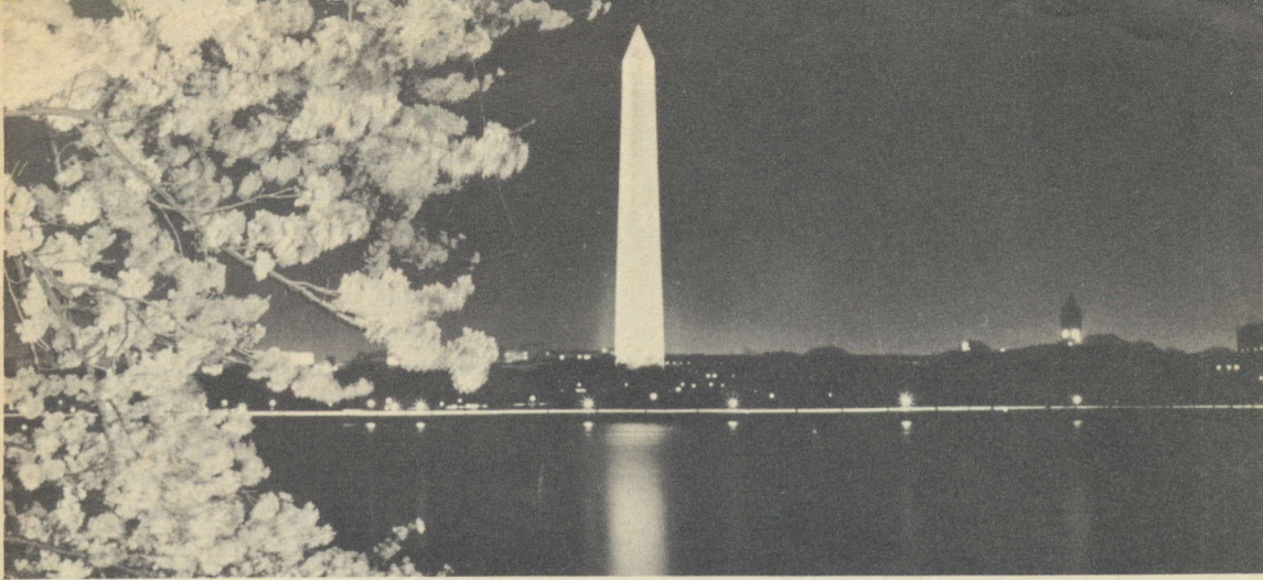
Night View of Monument

high and 250 feet in diameter, surrounded by 30 columns each 12 feet in diameter and 45 feet high. This temple was to be an American pantheon, a repository for statues of Presidents and national heroes, containing a colossal statue of George Washington. The proportions of Mills' shaft, which were at variance with traditional dimensions of obelisks, were altered to conform to the classic conception. This produced an obelisk that for grace and delicacy of outline is unexcelled by any in Egypt.