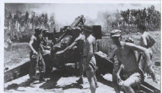
Marines of the III Amphibious Corps Artillery fire one of their 155-mm howitzers in support of the 305th Infantry's attack on the Orote Peninsula, July 22-24, 1944.

Guam remained in Japanese hands for two and a half years and Chamorros were forced to endure the hardships of military occupation in a war not of their making. For the first four months the island was controlled by army troops, who were housed in schools and government buildings in Agana. The island was renamed Omīya Jima (Great Shrine Island) and Chamorros were required to learn the Japanese custom of bowing. Japanese yen became the island's currency, and civilian affairs were handled by a branch of the army called the minseisho. Cars, radios, and cameras were confiscated and food was rationed until supplies became exhausted. Chamorros suspected of hiding family members wanted by the Japanese, or of aiding the few Americans that did not surrender, were harassed, beaten, or tortured, and, in some instances, executed by order of the authorities.