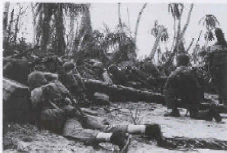
Marines take cover behind bomb and shell debris and fallen coconut trees, July 1944.

The Guam operation "was brilliantly and valorously conducted and resulted in the recovery of important American Territory and the liberation of loyal people. Well Done." 53 —Admiral Chester W. Nimitz