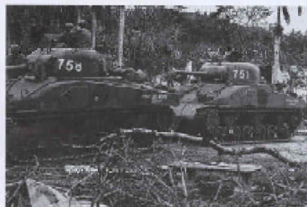
U.S. Army tanks of the 77th Infantry Division take a few moment's rest to view the damaged ruins of Agana (now Hagåtña).