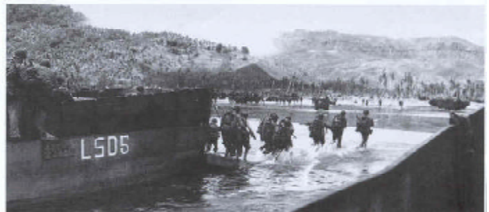
Assault troops of the 3rd Marine Division wade ashore under fire at Asan Beach, July 21, 1944.

ways for airstrips, and dig hillside caves, trenches, and other Japanese defense fortifications.