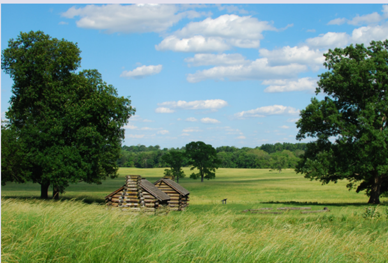
The Grand Parade at Valley Forge National Historical Park.

Located about twenty miles northwest of Philadelphia, Valley Forge National Historical Park preserves the grounds of the Continental Army's most legendary winter encampment of 1777-1778. The park commemorates the army's perseverance to overcome the hardships of that winter and their transformation into a professional fighting force. On May 6th, 1778 the army celebrated the French Alliance on the Grand Parade grounds of the encampment. This alliance brought General Rochambeau and his French army to the United States two years later.