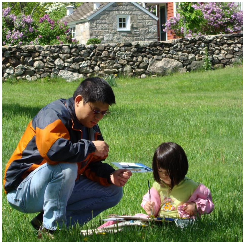
A father and daughter participating in the Take Part in Art program on a sunny Sunday afternoon.

All parking will be at the Branchville School at 40 Florida Road in Ridgefield, Connecticut. Shuttles will run continuously to and from the farm from 9:00 AM to 5:00 PM. There is no fee to participate. Simply park at the Branchville School, ride the shuttle to Weir Farm National Historic Site, and experience the fun of creating art en plein air ! In the case of severe weather, a rain date has been scheduled for Sunday, June 7.