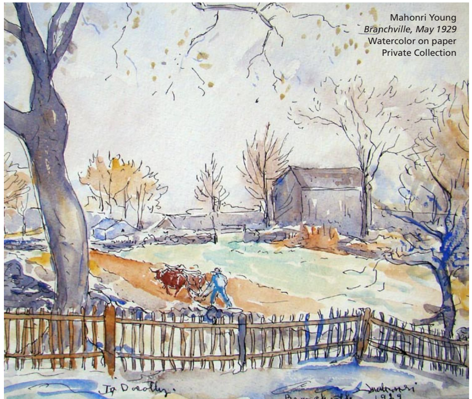
Mahonri Young Branchville, May 1929 Watercolor on paper Private Collection

Wilfred Von Glehn Writing to J. Alden Weir after enjoying a visit to Weir's Branchville farm