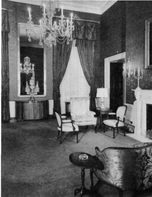
The Red Room

colored Vermont marble; floors are of gray and pink Tennessee marble. The entrance to the main stairway, which was formerly from the corridor, is now from the east side of the lobby. Seals of the Thirteen Original States are carved on the marble-faced opening of the stairway. On the opposite wall, a large mirror reaches from floor to ceiling. A red rug extends the length of the corridor.