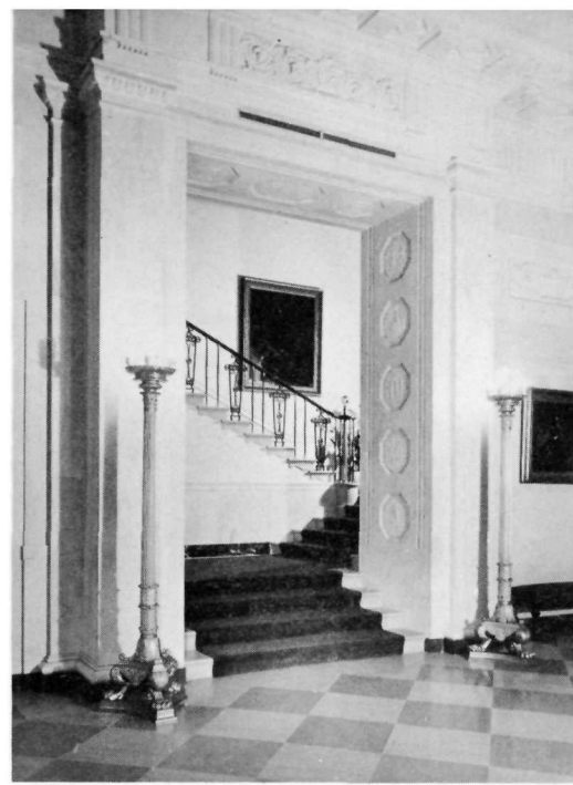
Entrance Lobby and Main Stairway

Six classic columns separate the entrance lobby from the main corridor. The columns and the pilasters spaced along the walls are of vari-