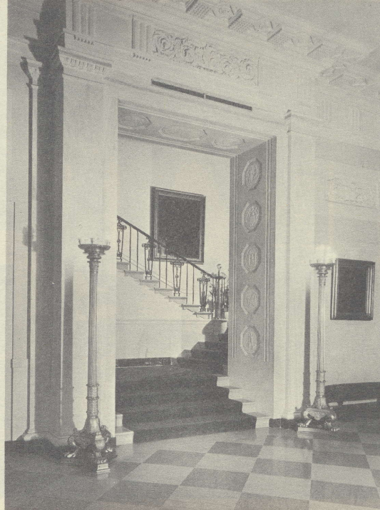
Entrance Lobby and Main Stairway

In general, furnishings and decorations are predominantly 18th-century Georgian in style. Furnishings of historic interest have been retained, with much of the old furniture refin-