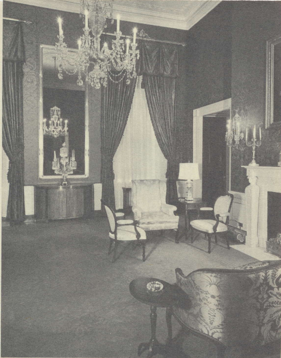
The Red Room