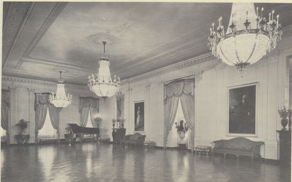
The East Room

A few important changes were made in the White House between 1903–48. The Executive Office building was enlarged in 1910; several guest rooms were made in the attic during President Woodrow Wilson's administration;