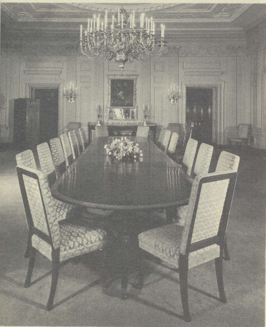
The State Dining Room

ished and re-covered to harmonize with the color scheme of various rooms. Some of the recent furnishings were given by anonymous donors. Portraits of several Presidents hang from the walls of the lobby, main corridor, and rooms of the first floor, except in the Blue Room.