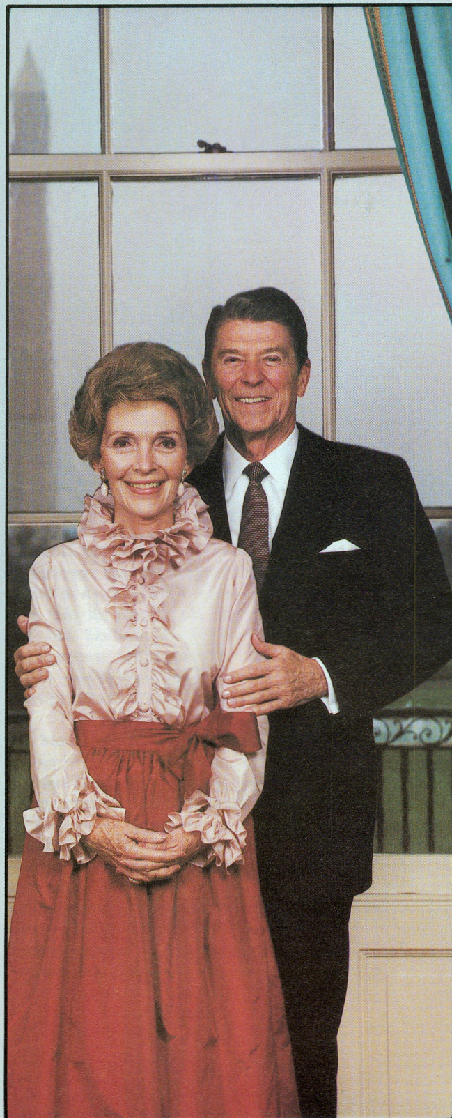
President and Mrs. Ronald Reagan

Grounds (not shown on plan). The White House is enhanced by the natural beauty of its informal, carefully landscaped grounds, which include flower gardens, well-kept lawns, and many trees of historic interest, such as the magnolias planted by President Andrew Jackson and an American elm planted by John Quincy Adams. The Jacqueline Kennedy Garden and the Rose Garden are adjacent to the east and west terraces respectively.