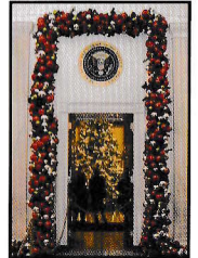
White House Historical Association

“Tinsel and Tact in the White House” – How do you decorate a 132 room mansion when visitors flow through it all the time?