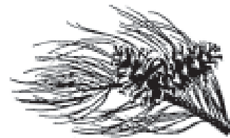
Knobcone Pine Pinus attenuata

The Ponderosa is a tall tree, up to 140 feet, tends to grow in stands and has plated reddish-orange bark. Needles are in bundles of 3, dark-green, and 5-10 inches long. Egg-shaped cones, 3-5 inches long, have prickles pointed outward.