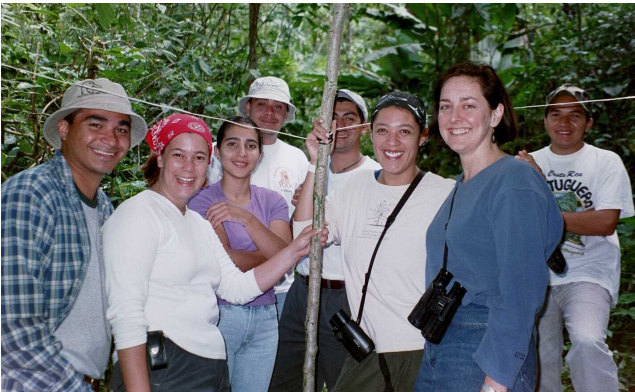
NPS and NFWF provide technical assistance to biologists and park guards for a bird monitoring training in Honduras.

For more information on the Park Flight Program and NPS Migratory Bird Conservation Program, contact the Biological Resource Management Division at the Natural Resource Program Center, 970/225-3592.