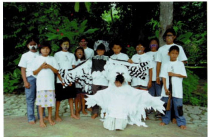
Panamanian children participate in an environmental education activity on bird conservation.