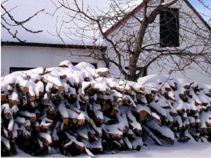
Fire wood may contain pest beetles